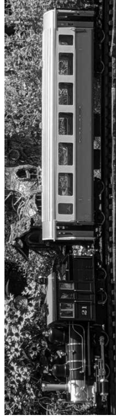
Columbus Garden Railway Society