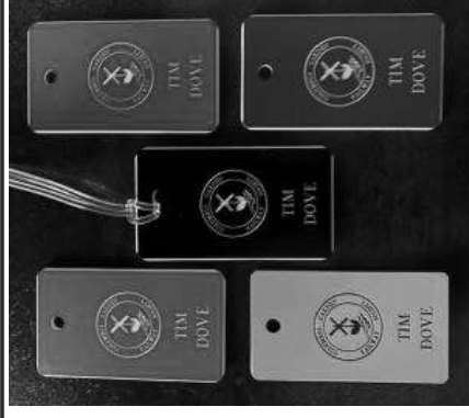
Name Tags with Magnet fastener $6 each