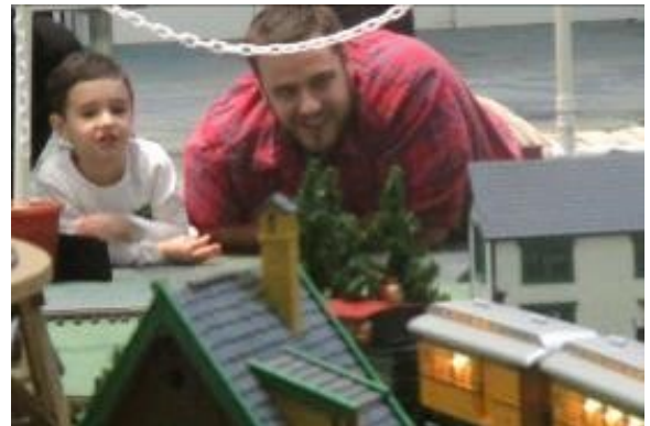
File photos from C.O.S.I.'s Model Railroad Days 2018 & 2017