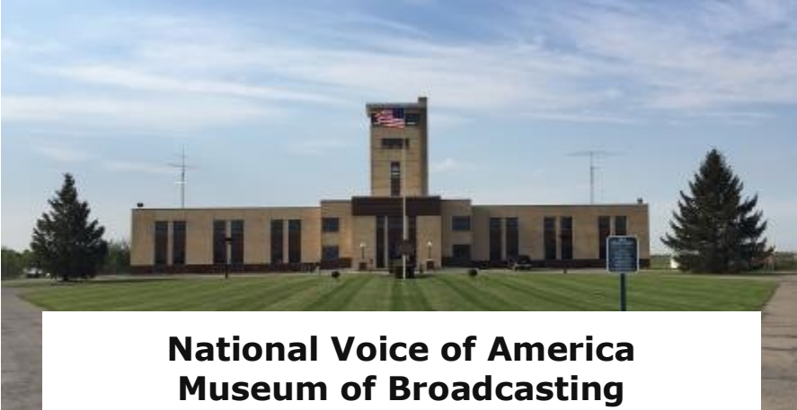
National Voice of America Museum of Broadcasting

ON TRACK is intended as a medium in which to air the news and views of the Columbus Garden Railway Society members. CGRS is an informal group which meets monthly or thereabouts to share a common interest in garden railroading and to socialize. Membership is open to all interested persons. All articles in this newsletter are provided by the editor unless otherwise noted.