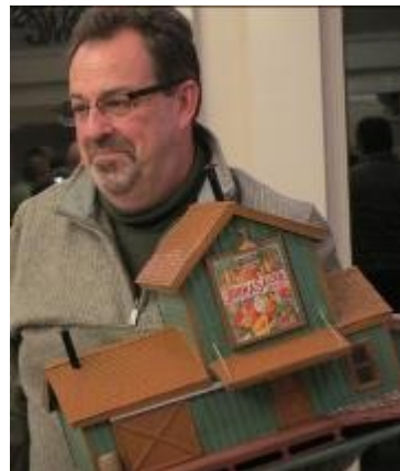
Some of our lucky banquet raffle winners!