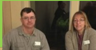
All photos on this page by Ginny Clark, except two marked with KS and mystery photographer of Ginny at top right.