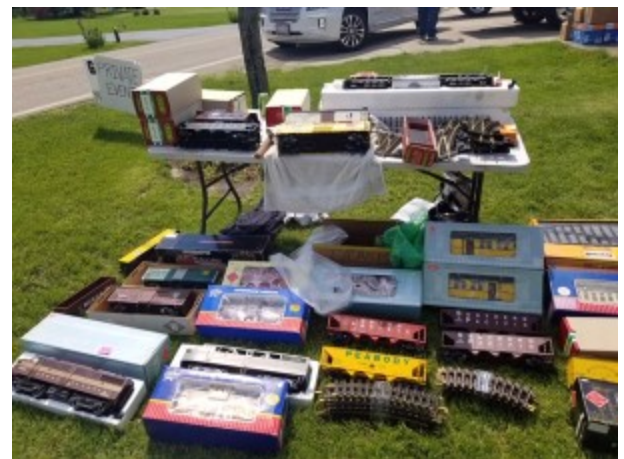
Three-Club Event continued on page 4