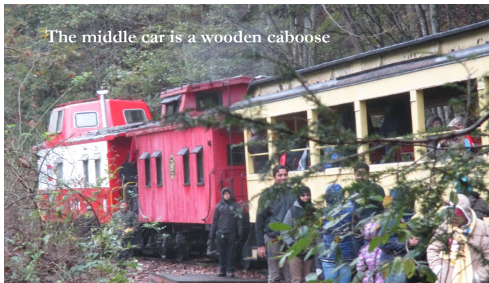
The middle car is a wooden caboose

About 11:10 the train stopped so we could get out and stretch our legs — nothing very scenic to explore but the river was nearby. After picking up a castaway caboose and getting water from the river for the steam locomotive, we were back in the station about noon. On