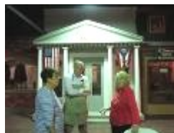
Some of the staff inside the Old Main Street Museum

beef, a quarter of a chicken, mashed potatoes with beef gravy, corn, roll, and apple or cherry pie. Way too much food but very good.