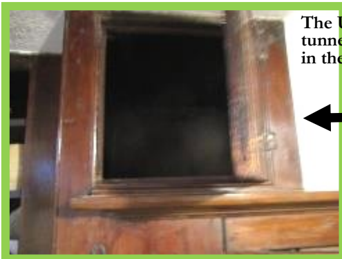
The Underground Railroad escape tunnel above the fireplace mantel in the Temperance Tavern Museum