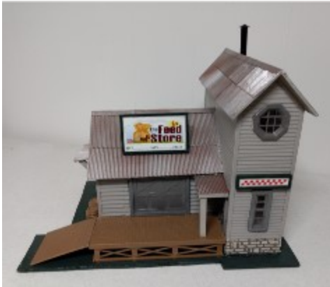
Scratch-built buildings created by Jim Kimmel