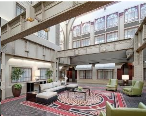
Left photo: looking from upper level into lobby of Indianapolis Union Station/Crowne Plaza Hotel and at right, the lobby (internet photo)

There are three tracks of stationary trains that have been converted into hotel rooms. We were in the Cole Porter car and they were in the Amelia Earhart car. I was a little disappointed because the cars were not specially decorated like they used to be. Years ago we stayed in the Emmett Kelly car and it was decorated with circus pictures and a clown border.