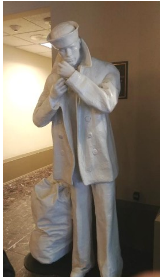
Below photo: one of the many statues in the Union Station; Bottom left: Union Station, Indianapolis, IN of Romanesque architecture, photo obtained from the internet