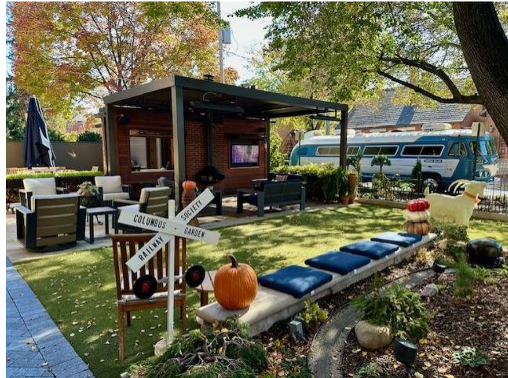
Columbus Garden Railway Society