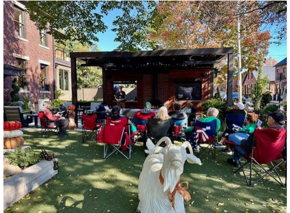
Columbus Garden Railway Society