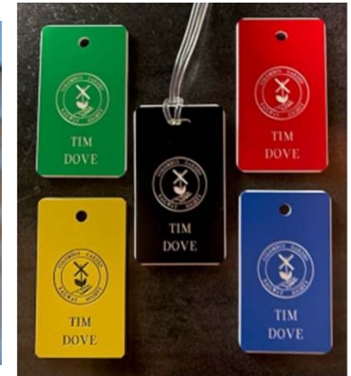
Name Tags with Magnet fastener $6 each