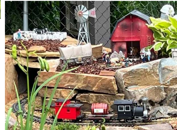
Columbus Garden Railway Society