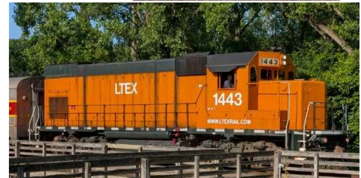
Columbus Garden Railway Society