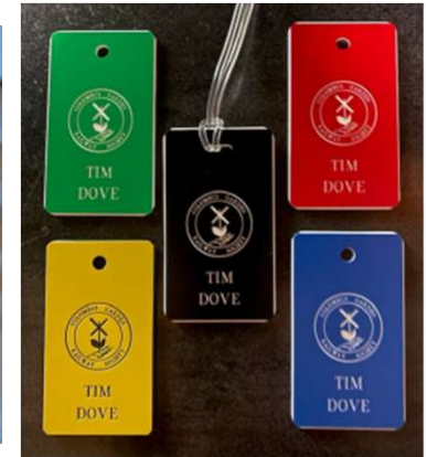
Name Tags with Magnet fastener $6 each