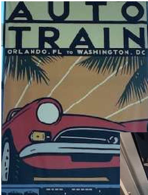
Nice Roomette for 2 & fun club car.