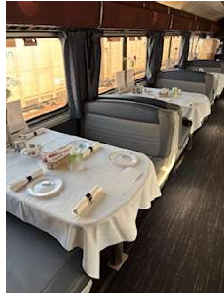
The food and service was good!